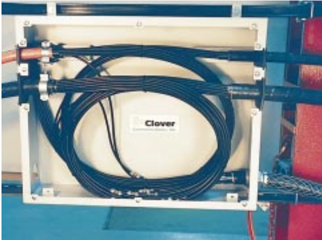
The FutureFlex Air Blown Fiber System manufactured by Sumitomo Electric Lightwave Corp. depends on tube distribution units such as this one to route tube cables through an installation.

TDU locations are generally chosen to permit splicing at divergence points, building exit points, manholes, or locations that cannot be installed until later. If a tube bundle gets cut, fiber can be blown out, tubes spliced, and new fiber blown in—usually in far less time than traditional fiber-splicing techniques permit.